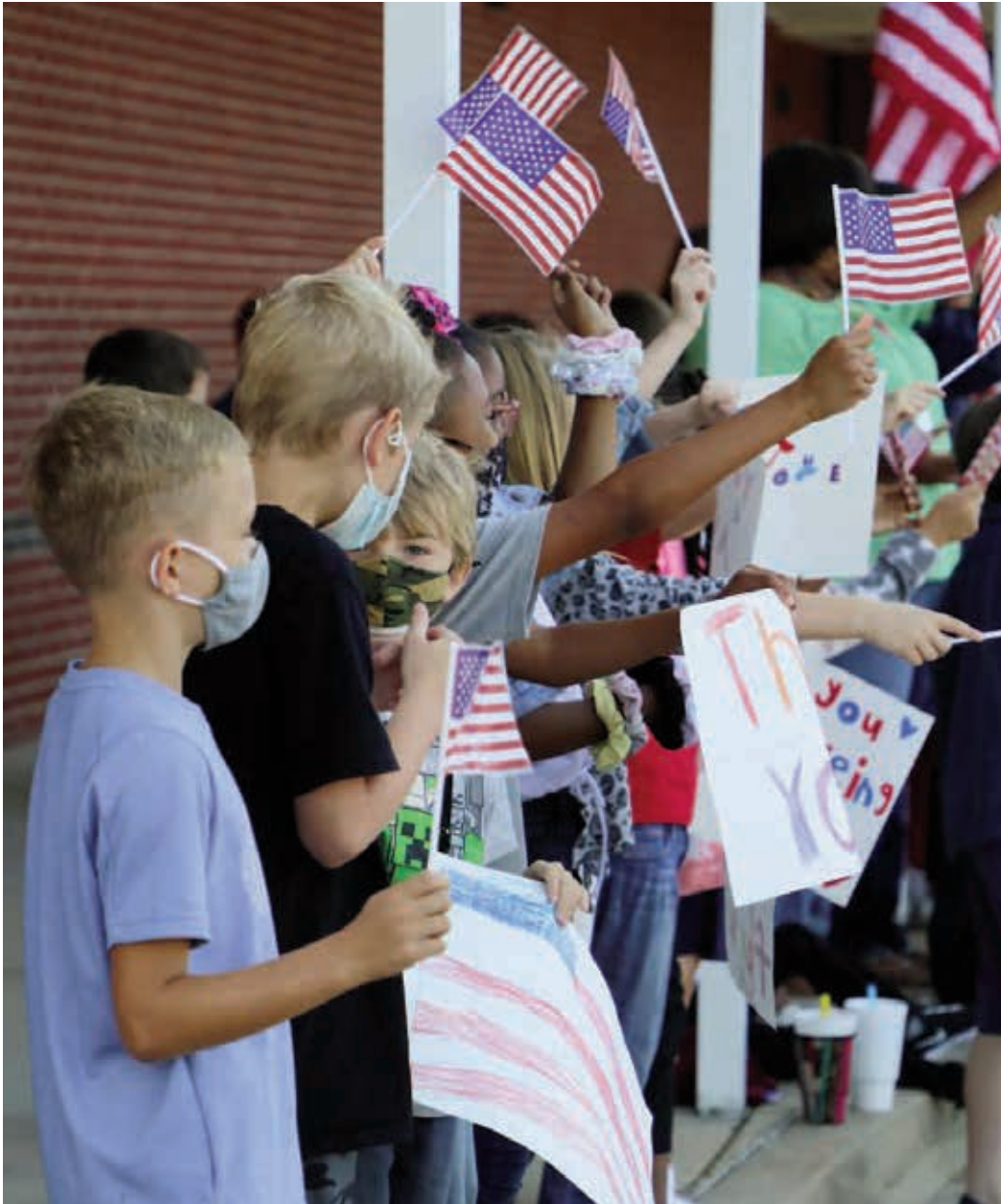
Madison Crossing Elementary students held a parade for first responders to commemorate the 20th anniversary of 9/11.