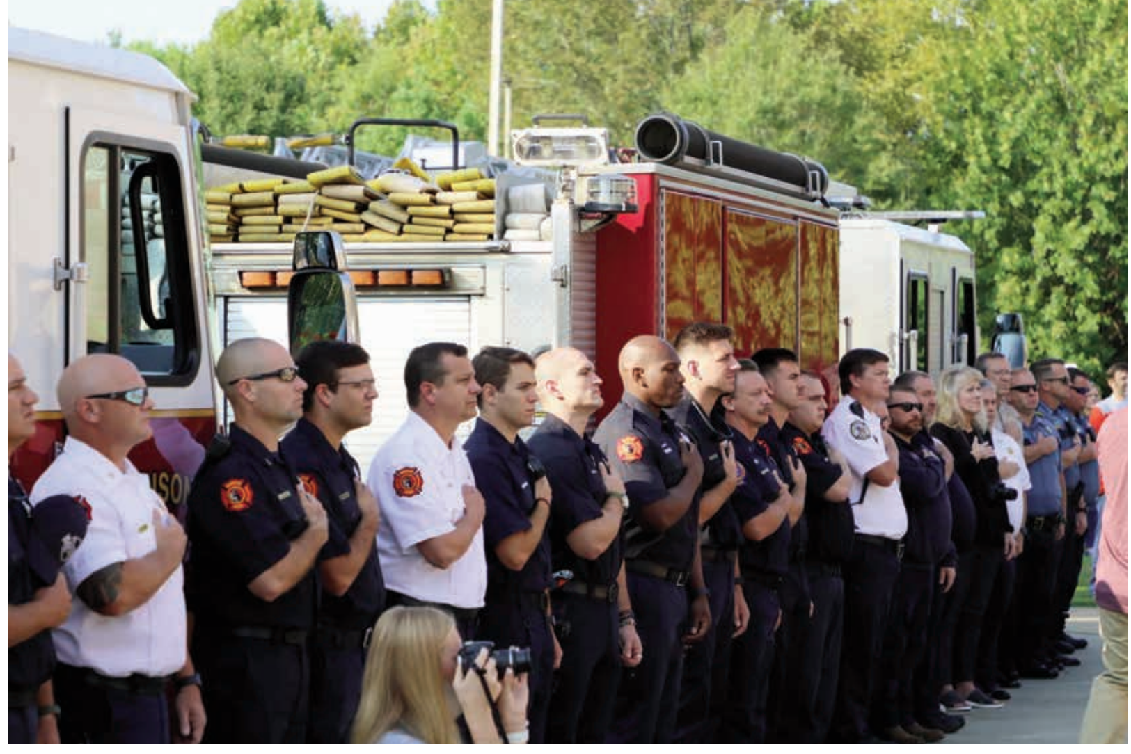
Madison firefighters say the Pledge of Allegiance during a 9/11 ceremony marking the 20th anniversary of the terrorist attacks. The ceremony was organized and hosted by the Madison Central High School Air Force JROTC.

VOLUME 40 NUMBER 37 Copyright © 2021 Madison County Journal MADISON COUNTY, MISSISSIPPI www.madisoncountyjournal.com SEPTEMBER 16, 2021 ** $1.00