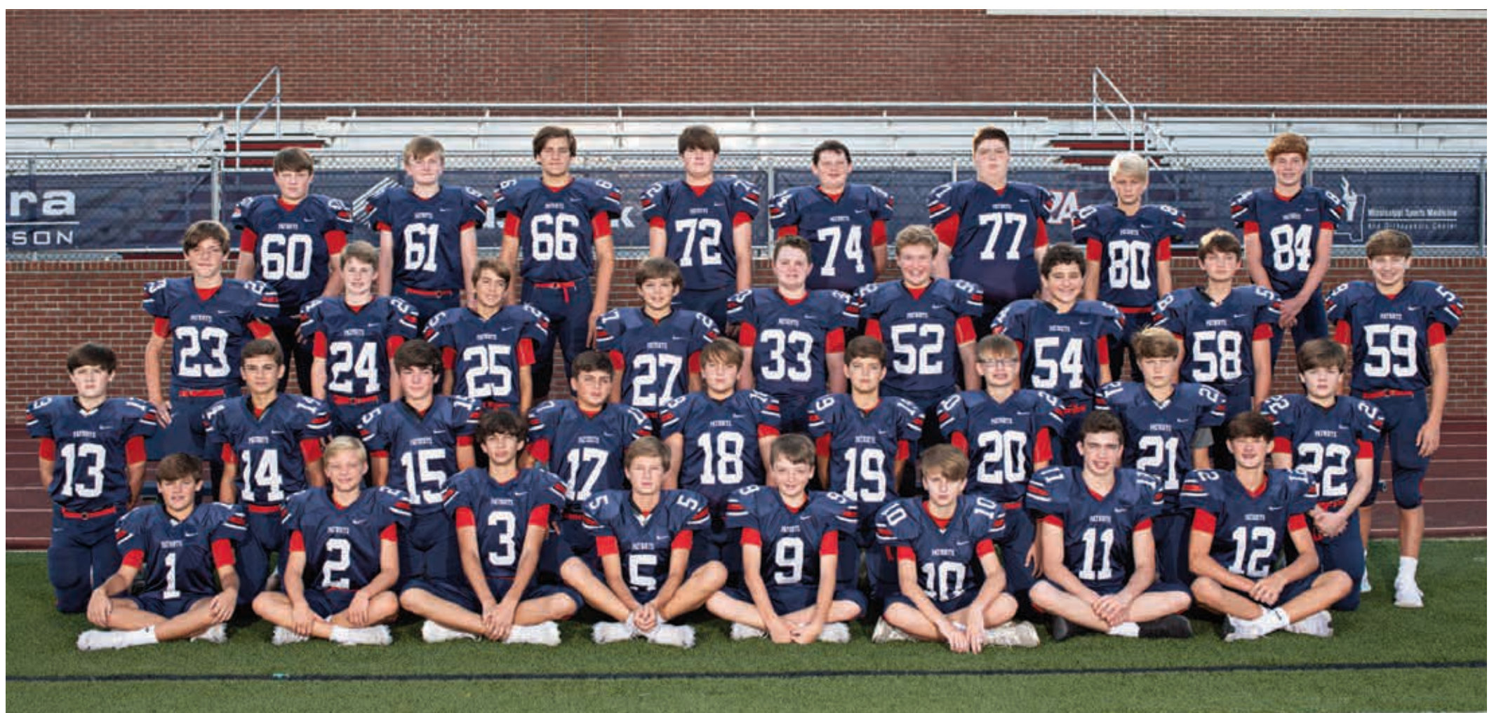
MRA 7th Grade football team